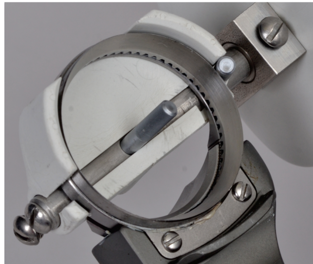
Trimmer locator precisely guides the trimmer against the inside and outside blade steeling rods for fool-proof edge restoration.