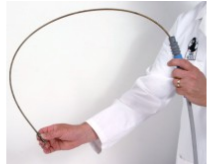
Remove flex shaft from casing.