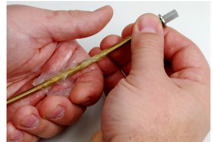
With a small portion of WhiZLube in your hand, apply an even coat along the entire length of the flex shaft.

Clean and lubricate after every 20 hours of operation.