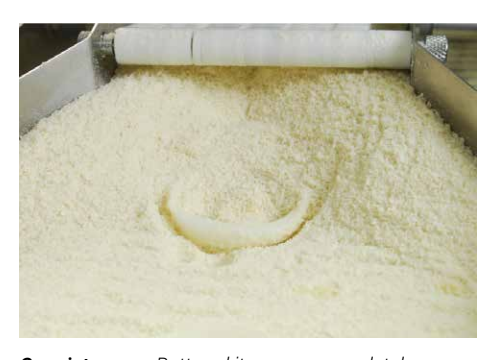
Consistency – Battered items are completely and evenly coated.

Hand-breading foods is messy, tedious, slow work. The Optimax® is exactly the opposite ... it provides a consistent coating while excess breading falls back into the conveyor to be used again.