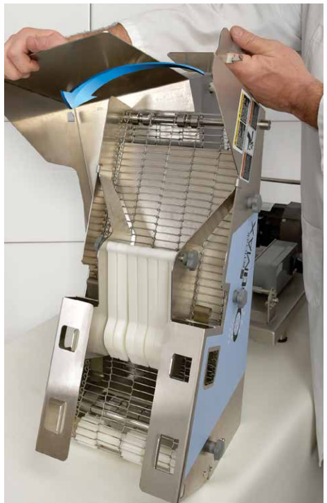
New split breading conveyor is easier to lift – and it separates for ease of cleaning.